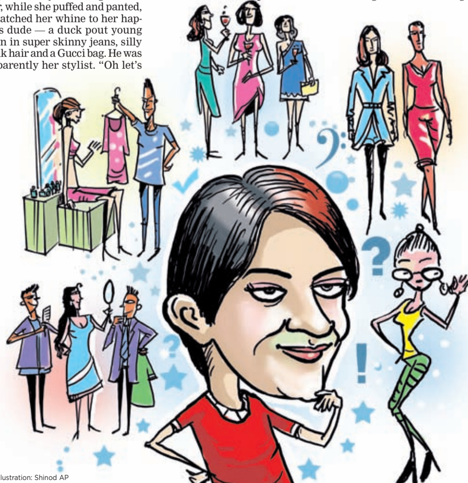
Illustration: Shinod AP

way display was seen with new arm candy everyday. As publicists and event organisers desperately tried to woo patrons into the lounges where certain designers were 'chilling out',